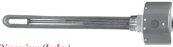
E1 — Dimensions (Inches)